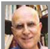
Stavros Dimas, European Commissioner for the Environment.

2009 is an important year for European water policy. By the end of the year the first River Basin Management Plans must be established, laying down specific measures to ensure that all EU waters reach good quality status by 2015.