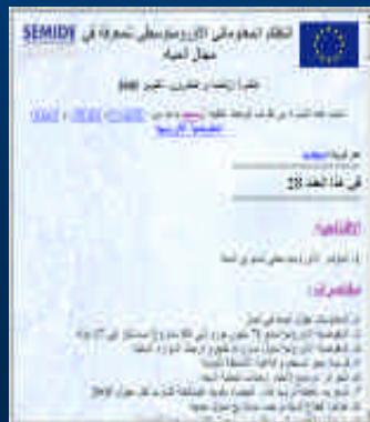
Monthly eNews Flash in Arabic, English and French