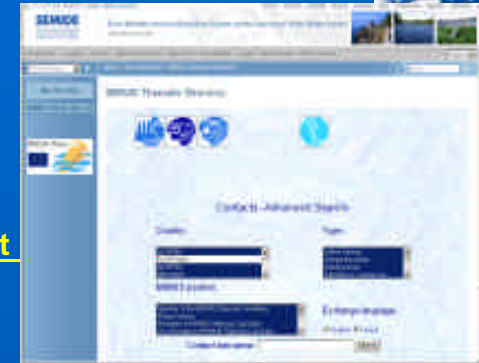
« who does what »