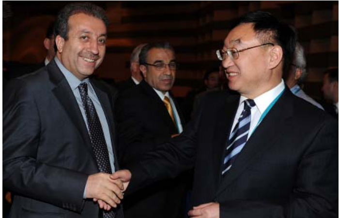
L-R: Mehmet Mehdi Eker , Minister of Agriculture and Rural Affairs, Turkey, and Chen Lei , Minister of Water Resources, China

In the panel on China, Chen Lei, Minister for Water Resources, China, highlighted his country's central role in world food security, noting that this security is challenged by land degradation, population growth, climate change and water scarcity for food production.