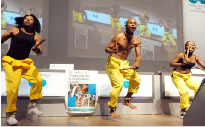
South African dancers perfomed during the Africa Regional Day

ASIA-PACIFIC: On Friday, Ravi Narayanan, Vice-Chair, Asia-Pacific Water Forum (APWF) Governing Council, launched the Regional Document, saying it addresses, inter alia : water financing and capacity development; water-related disaster management; monitoring of investments and results;