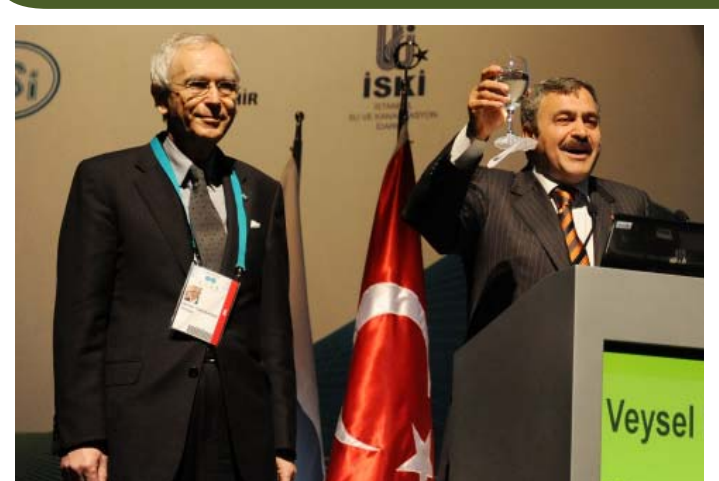
L-R: Oktay Tabasaran , Secretary General, World Water Forum, and Veysel Eroğlu , Minister for Environment and Forestry, Turkey, who shared a Turkish proverb with participants.