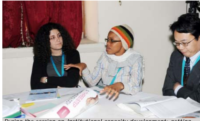
During the session on Institutional capacity development: getting the balance right for equitable water allocation, participants shared success stories from their regions.

The road less travelled (no more)?: Participants discussed the need to build bridges among professional associations, the development community and civil society organizations. They noted that broad consensus had emerged that professional associations are critical stakeholders in delivering results and sustaining projects on the ground, and their role was