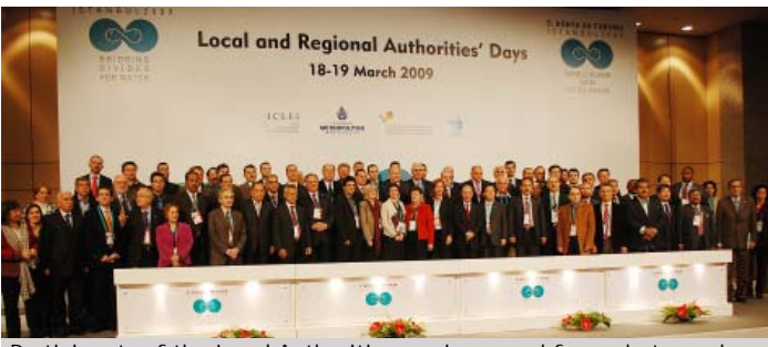
Participants of the Local Authorities session posed for a photograph

LOCAL AUTHORITIES' DIALOGUE: Some 91 local authorities and 200 mayors met on Wednesday and Thursday afternoon to discuss the Istanbul Water Consensus (IWC). On Thursday a panel focused on: the responsibilities of local authorities; the need to mobilize financial resources for water and sanitation; the impacts of climate change; and disaster planning and management. Participants emphasized their key