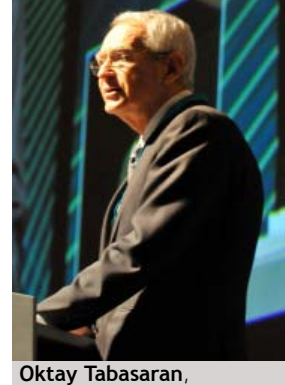
Oktay Tabasaran, Secretary General of the 5th World Water Forum

water. He highlighted the role of political will in enabling