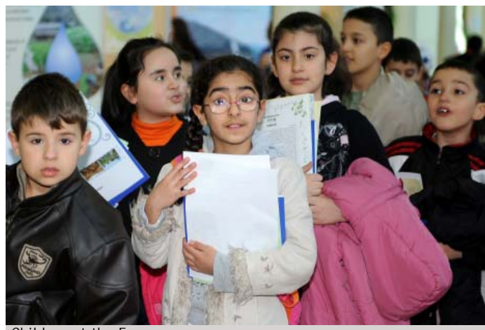
Children at the Forum

advance dialogue on the right to water and sanitation. Some argued that legal entitlements are necessary for accessing the benefits of a right to water and sanitation.